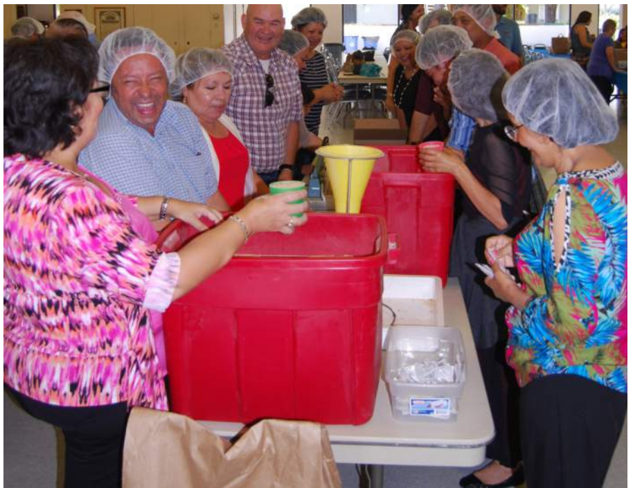
Members of the Class of 2015, Hands of Christ, prepare food packages for Kids Around the World on Father's Day at St. Edward the Confessor Parish in Dana Point.