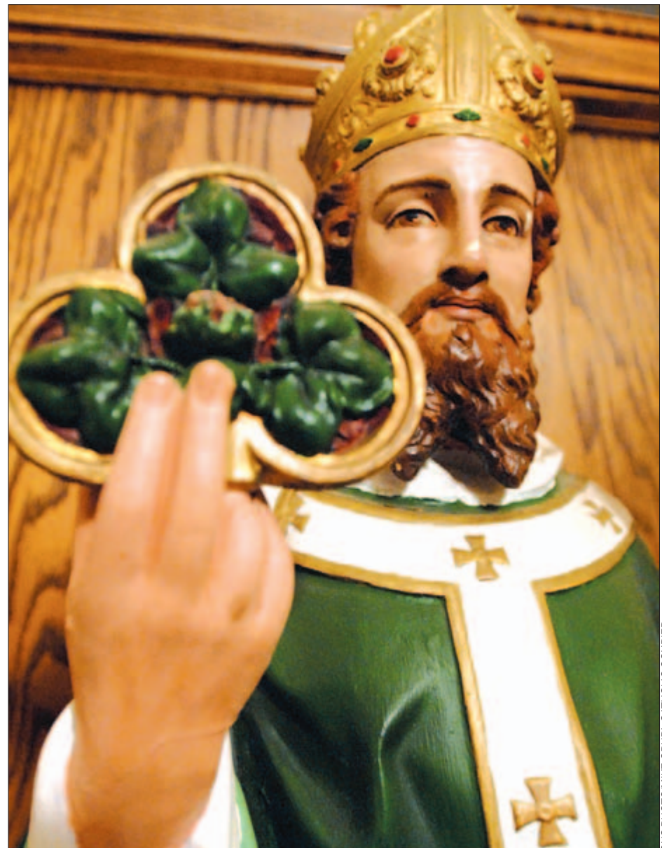
A statue of St. Patrick holding a shamrock is seen inside St. Patrick's Church in Victor, N.Y. Legend says that he used the shamrock to describe the Trinity to those he sought to convert. His feast day is March 17.