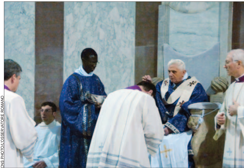
Pope Benedict XVI distributes ashes during a Mass on Ash Wednesday at the Basilica of Santa Sabina in Rome Feb. 21.