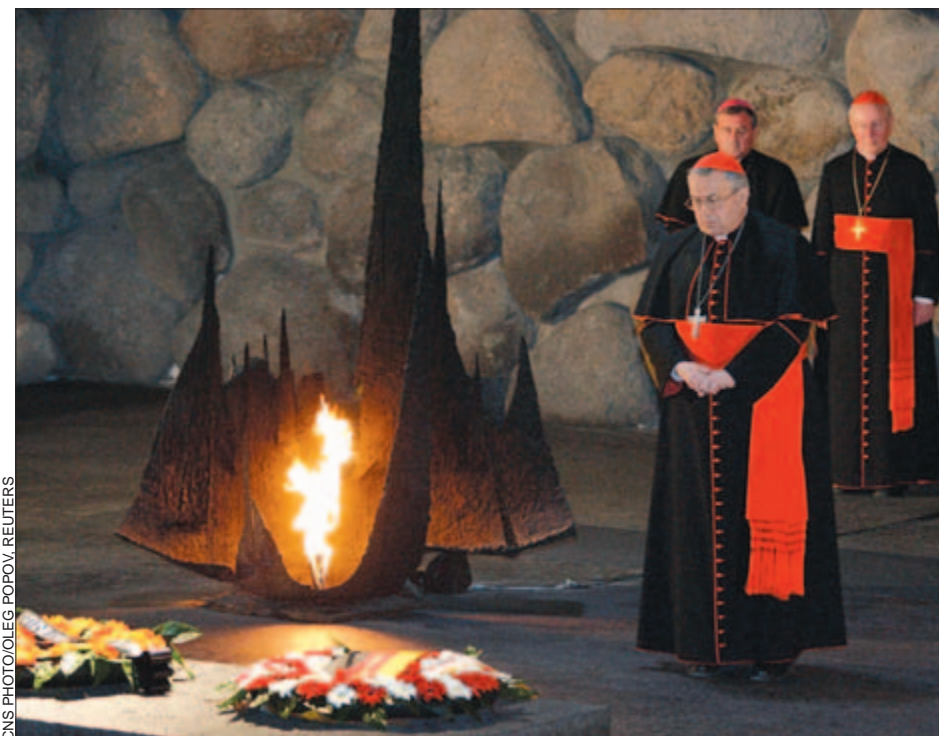
German Cardinal Karl Lehmann of Mainz observes a moment of silence after laying a wreath in the Hall of Remembrance at the Yad Vashem Holocaust Memorial in Jerusalem March 2. Cardinal Lehman was visiting the memorial with a delegation of German bishops.